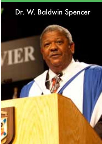
Dr. W. Baldwin Spencer

International Institute beginning in 2010.